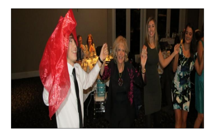
Gëzuar 55 Vjetorin e Krijimit të AANO Çikago